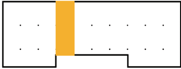
Building Key Plan

709 East Ordnance Road Suite 504 Baltimore, MD 21226