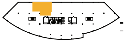
Building Key Plan

8840 Stanford Boulevard Suite 3120 Columbia, MD 21045