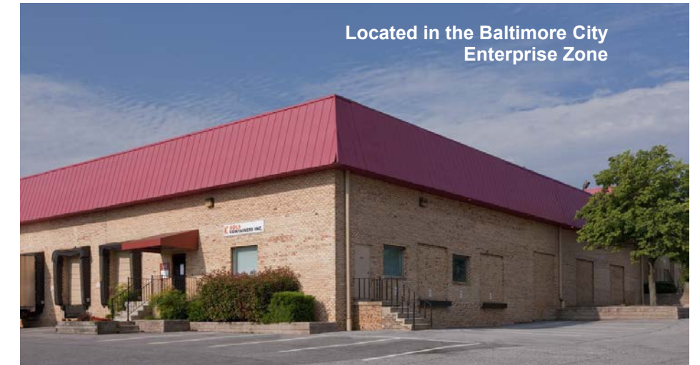
Located in the Baltimore City Enterprise Zone

1400 - 1464 DeSoto Rd. Baltimore, MD 21230