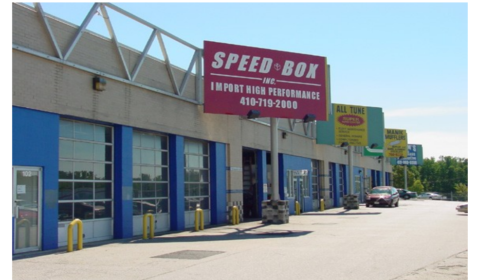
Fronting Route 40 near Rolling Road in Catonsville, MD