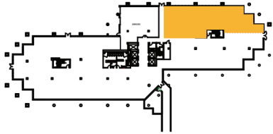
Building Key Plan

1954 Greenspring Drive Suites LL20-LL22 Timonium, MD 21093